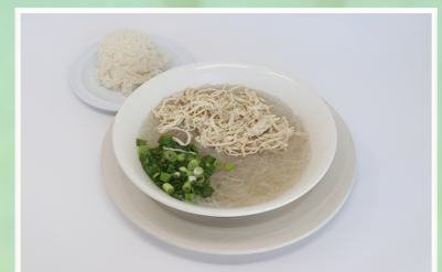
Chicken Long Rice