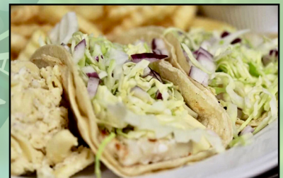
Hana Fish Tacos