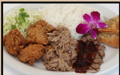
Lahaina Platter #1