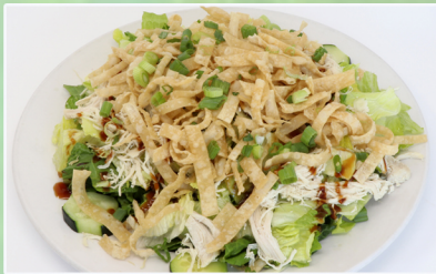
Chinese Chicken Salad

Seared Ahi Tuna Salad - Romaine & iceberg lettuce, tomatoes, carrots, red & white onions, seared ahi tuna, and our spicy mustard dressing 14.99