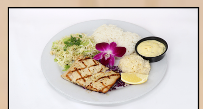
Grilled Mahi Mahi