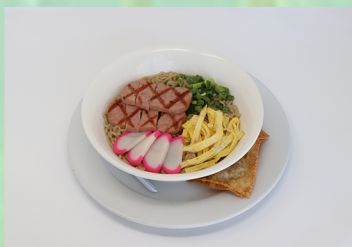
Saimen Noodles with Spam

Chicken Long Rice - Bean thread noodles and chicken breast in a homemade broth Cup 3.99 Meal 8.69 (Meal: large bowl served with rice)