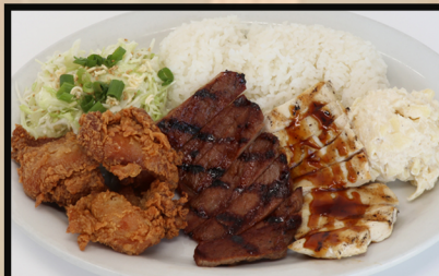
Lahaina Platter #2