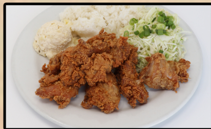
Lahaina Fried Plate