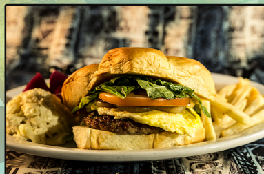
Portuguese Sausage Sliders