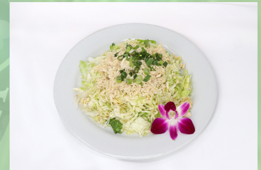
Ramen Cabbage Salad