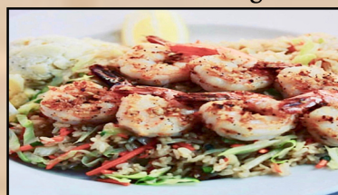
Hawaiian-Style Shrimp Scampi