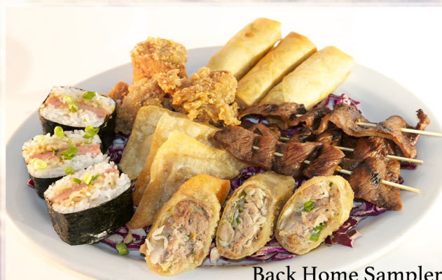
Back Home Sampler

Hawaiian Nachos Wonton chips seasoned ground pork, jack & cheddar cheese, topped with diced tomatoes and green onions Half order 5.95 Full order 9.99 add HBBQ Chicken 1.00 add HBBQ Beef 1.50