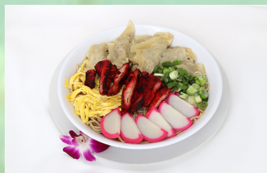
Big Braddah Wonton Min